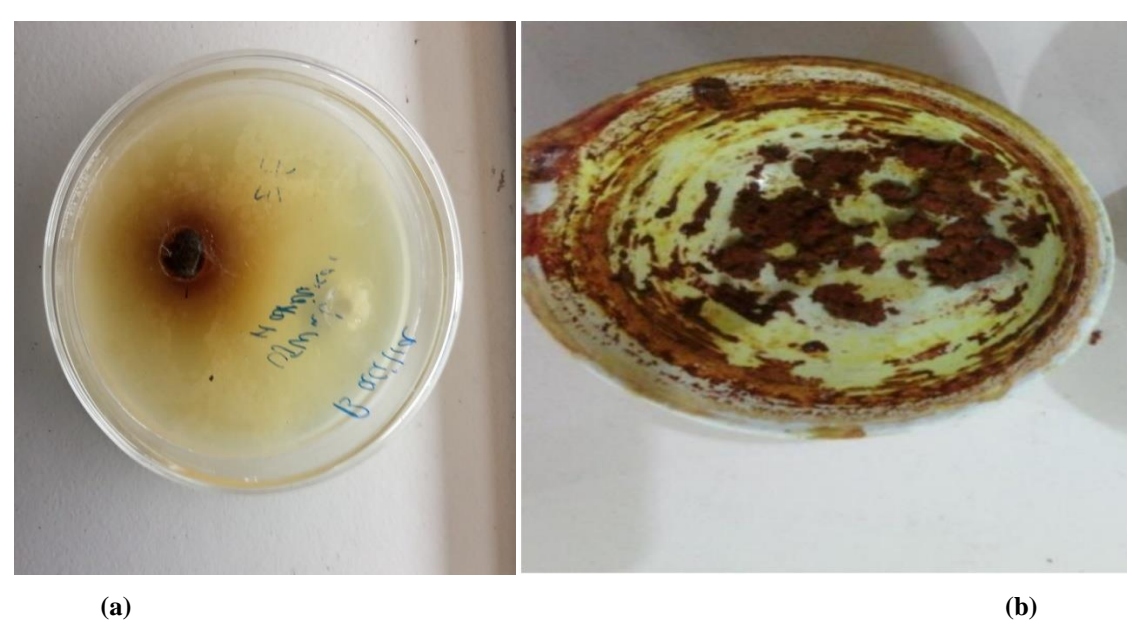
Fig.No.3: Diffusion Study of Morinda Extract (a) & loss on drying test (b)