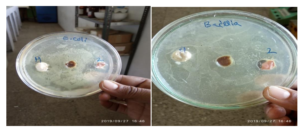
Fig.No.2: Zone of Inhibition of Morinda Citrifolia & Standard Ointments Himalaya (H) & Zakhameruz (Z) against Bacillia Sp & E.Coli bacteria.