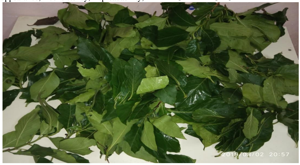
Fig No: 1 Fresh Morinda Citrifolia Leaves

Morinda citrifolia is Native to tropical & subtropical Asia and Australia, Dicotyledonae belong to phylum Spermatophyta and subphylum Angiospermae. Synonym of Morinda Citrifolia is Indian mulberry (Noni), Cheese fruit and its biological source is belong to Rubiaceae family which bears fruits Yellowish green/white, 10-18 cm(3.9-7.1 inch) and leaves are green, 20-45cm long, 7-25cm wide. The whole plant have pungent odour.[1]