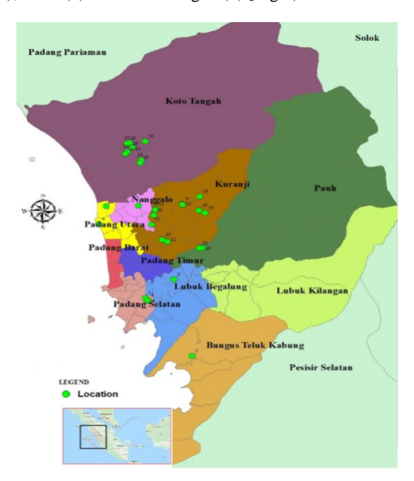
Fig 1. Map of research location points

Overall research was conducted during January - April 2018. Based on secondary data [3], there are 30 groups of catfish cultivation in Padang City which spread over 8 sub-districts i.e Bungus Teluk Kabung, Lubuk Begalung (1), South Padang (3), North Padang (2), Nanggalo (1), Kuranji (11), Pauh (2) and Koto Tangah (9) [Fig 1).