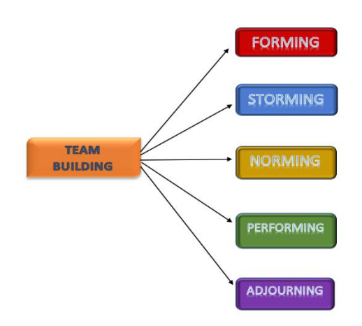
Fig.3 Stages of Team Building