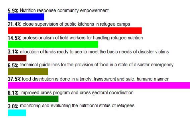
Fig. 3. Policy Priorities

From the results of the analysis in pairs for alternative policies, obtained policy priorities, in the order of which: food distribution is done on time, transparent and safe, humane and following with local conditions; Strict supervision of the communal kitchen; Professionalism of field energy for the handling of refugee nutrition; Improved cross-program coordination and sectoral; Food maintenance with disaster emergencies; Community empowerment of nutritional response; Ready-made fund allocation for basic needs; and monitoring and evaluation of the nutritional status of refugees that can be seen in Fig. 3.