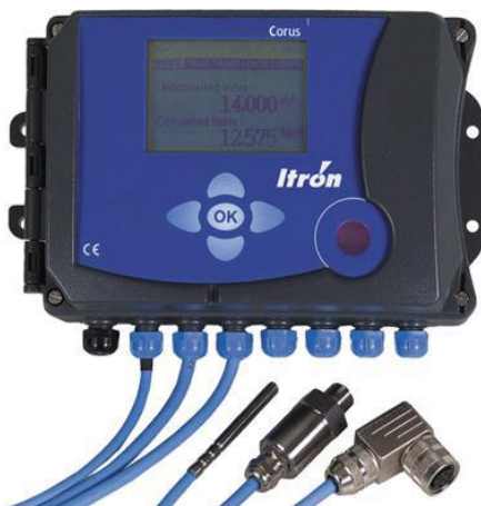
Fig. 2. Electronic Volume Converter Corus [5]

Corus is the name of the type of gas volume converter [4]. Corus is one instrument that supports the reading process of various gas meters, and one of them is a gas turbine meter. Corus shape can be seen in Fig. 2. Corus is designed to achieve high levels of performance and accuracy from robust electronic equipment so that the results of reading the fluid volume available on the gas turbine meter can be calculated more accurately with due regard to the amount of temperature, pressure and compressibility. In distributing data from reading, this tool uses flash memory so that it can store data either per unit day to per month. In the process of transferring reading and calculation data, Corus is also equipped with an infrared sensor that allows Corus users to download new firmware releases via PC or Laptop [5].