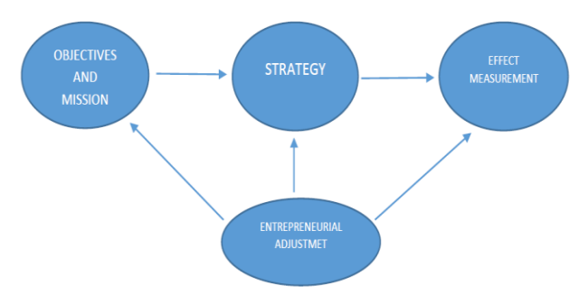
Figure 1: social entrepreneurship value created: the integration of strategy, purpose and effect extent

The literature survey produced various apparatuses effectively created for measuring social effect, the majority of which join with the effectively existent apparatuses in economy and trade. We proceed by exhibiting a rundown of their clarification and use.