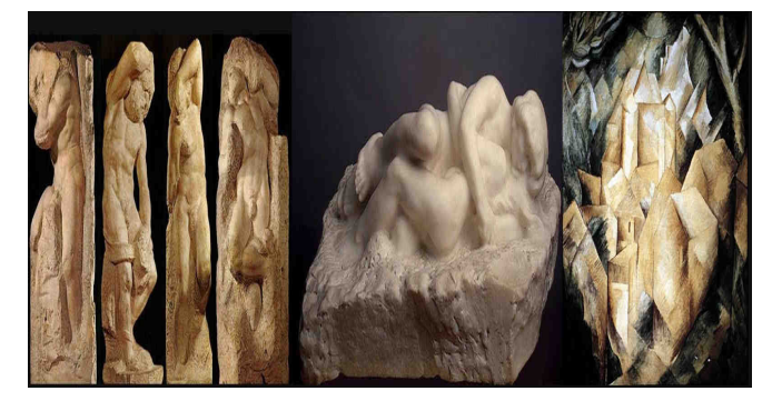
Figure 2. Buonarroti.M, Prisonners,1525-30; Rodin. A, Cupis and Psyche, 1905; Braque. G - La Roche Guyon, 1909.

There aren't many words to describe the surprise that you have to realize an architectural work perhaps only the completeness of a walk in a final architectural can explain this realization of the architect who is called creativity applied to space. But the creative process in architecture is a step really important for the result quality. Architecture, as art and a place where humanity discovers and conducts life experiences and as a discipline of construction, must meet human requirements and cannot be a self-referential exercise for the artist.Architecture cannot be a self-referential exercise because it is an art form that transforms the physical environment using irrational thought as psychic movement that is specifically human and instead differs from the instinctof animals.