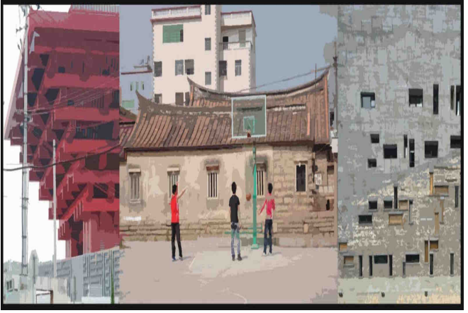
Figure 4 China Pavillion, Shanghai Expo: Better City better Life, 2010, Shanghai; Xi An Cun, Xiamen district, Old Houses, 2011, Fujian; Ningbo Museum designed by Wang Shu, 2008, Ningbo.

The 2008 Olympic Games were an invitation to a new relationship with the West. The Bird's Nest Stadium by Herzog and De Meuron, the National Grand Theater of China by Paul Andreu and the Headquarter of CCTV were the crystallizations of an architecture made by collaboration between Western architects and Chinese teams of workers. The Dalian Museum by Coop Himmelblau's and the Guangzhou Opera House by Zaha Hadid Architects are examples of works that aim to re-invent the image of cities that have suffered from urban sprawl in previous years.