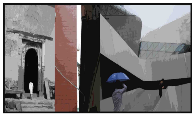
Figure 8 Nanjing Fujian Tulou; "Xin an Cun", Xiamen distric, Houses; Hadid. Z, Guangzhou Opera House, Guangzhou; China

intervention it is possible to read its dynamic complexity. Also the technological sustainability of the project, including the environmental suite, gives it an added value.