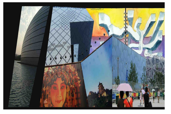
Figure 3 Beijing Architecture, Olimpic Games, 2008, China

In summary, the introduction of computer technology to the parametric iconography would result in a lull in the architectural landscape, which is disuse of the unconscious non-oneiric image in architecture. This reappropriation of natural forms in Parametric Architecture is implemented as if there were a loss of psychic movement transferred from the artist to the artistic object. Differently, for example, in the Art Nouveau of Guimard and Horta and the mesmerizing lines of Mackintosh, or the formal sinthesis of J.M. Olbrich, where the nature had been represented in architecture by recreating its image without imitation or exact reproduction. Within their work the iconic elements representing figure within the plant and animal world were recognizable, but in some ways the author's imagination have made it through the creative play of form, birthing an architectural image in the new sense and content. Another example of the potential uses of nature can be seen in the style of Xieyi Eccentrics Painters of Yangzhou in the 1600's who exceeded using figure reproduction and the signs of nature in their artistic depictions, against all academic tradition, were vague and unfinished though uniquely representative of their creators. I appreciate this image because it truly explains the concept of immense nature in China and its influence in society. Also, works by Xieyi Eccentrics Painters are the inspiration behind several famous works by Mad Architects.